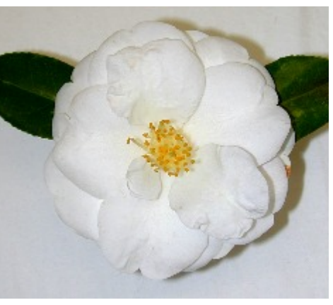
C. japonica "Leucantha," the white form of "Tricolor," was imported by McIlhenny in 1937.

middle ofwhich Senator Huev P. Long buried His "Jungle Gardens" contained 60 varieties of bamboo, 150 varieties ofazaleas, 700 plus varieties of camellias. and 1700 varieties of irises.