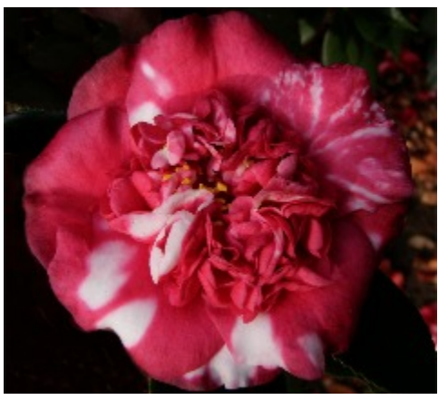
The original C. japonica "Governor Mouton" was moved to Avery Island in 1929 from the home of Governor Mouton near Lafayette, Louisiana.

Teche country. Varieties were primarily localized with owners spreading from their plants by cuttings and layering to their friends and neighbors. One local variety was Jeanerette Pink from the small town of