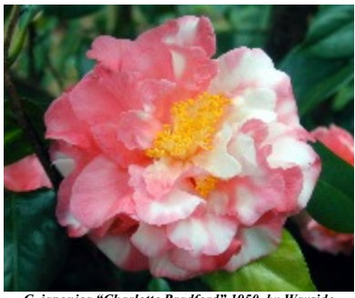
C. japonica "Charlotte Bradford" 1950, by Wayside Nursery, Ocean Springs, MS