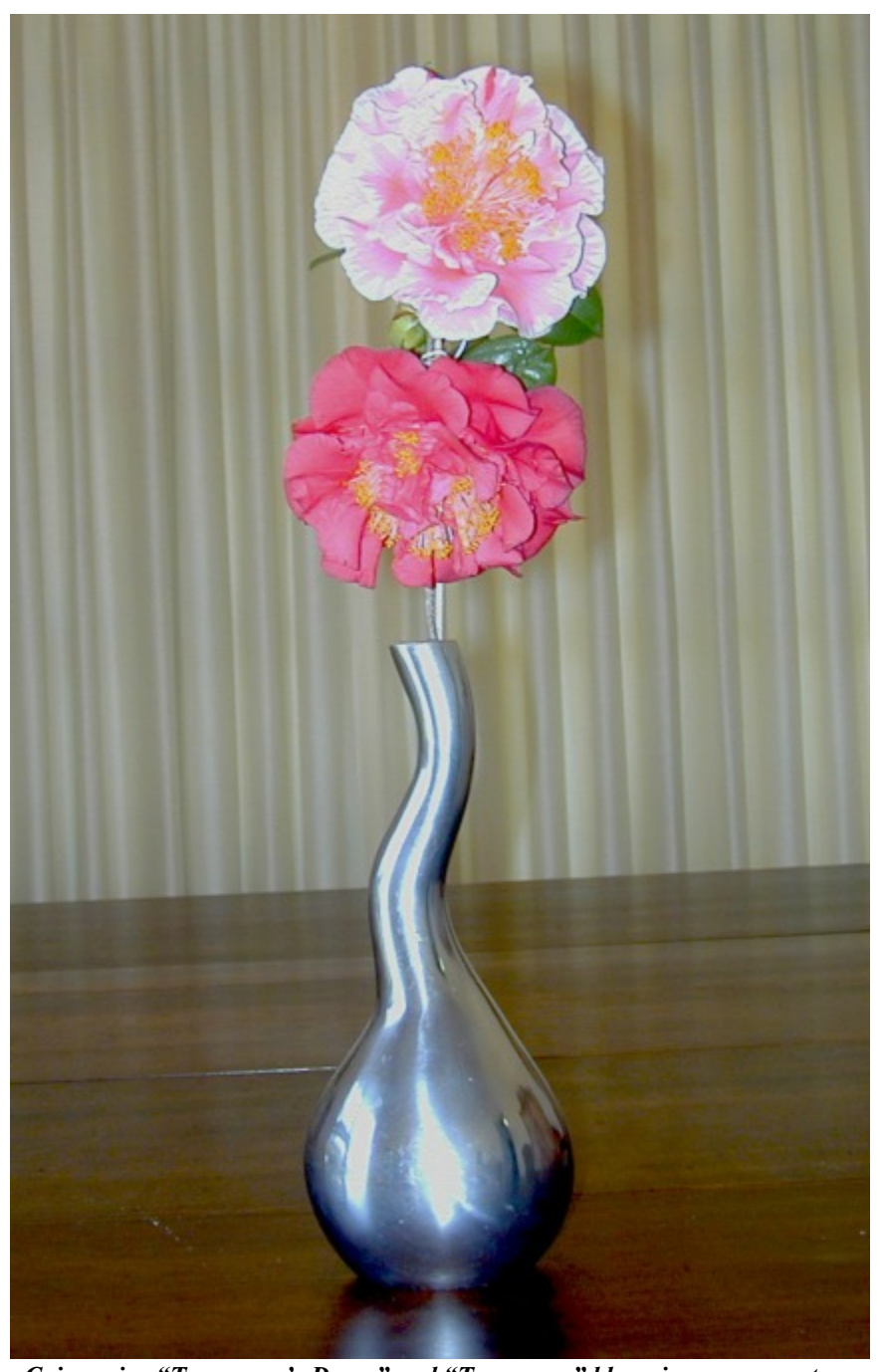
C. japonica "Tomorrow's Dawn" and "Tomorrow" blooming on same stem.