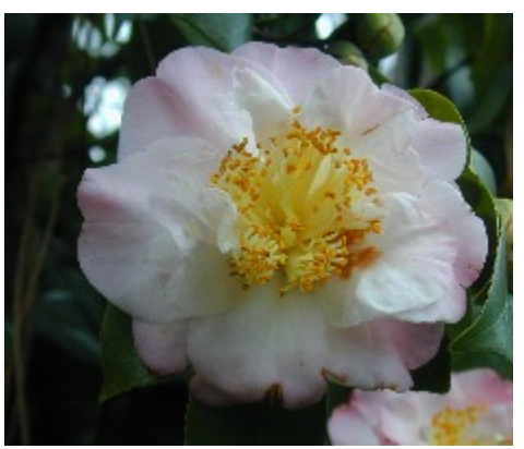
C. japonica "Nina Avery," one of many McIlhenny originations, was introduced in 1949.

tuary for a total of 175,000 acres of pristine coastal wetlands dedicated to wildfowl conservation--a remarkable gift to our state and to our country.