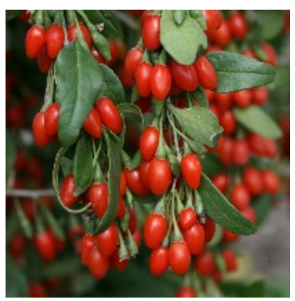
Lycium Barbarum, commonly known as "Goji Berry" is known in Scotland as the Duke of Argyll's Tea Tree."

It was stated earlier that in the early 18th century the drinking of tea was fashionable and only for the very wealthy. At a price then of 16 shillings a pound weight the Duke of Argyll of the time (Archibald Campbell, 3rd Duke, 1682-1761) requested some plants for the garden of his English estate at Whitton, near London. Among the plants delivered were a Camellia Sinensis and a Lycium Barbarum, but the latter plant became confused with its near relative L Chinense, causing the labels to get mixed up. So the Duke's surviving plant grew, with berries and long, spiny branches. There is no evidence that they ever tried to drink "tea" brewed from its leaves, but the plant's popular name remains in place to this day.