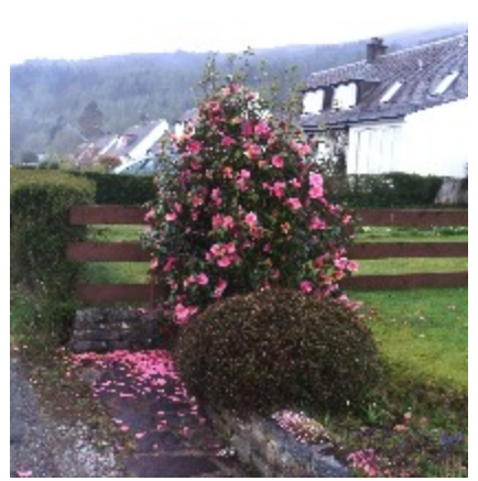
A williamsii hybrid growin in a private garden ing the village of Furnace, Argyll, Scotland.

spring gardens, free flowering over a long period if kept frost-free.