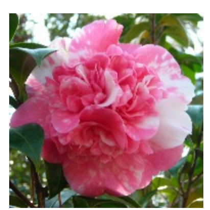
C. japonica seedling 'LSU #5'

This pink and white variegated peony form flower with a white skirt, like that on the left, was developed at L.S.U in the 1960s. It was never named or registered because most of the flowers had irregular pink and white variegations like that on the right.