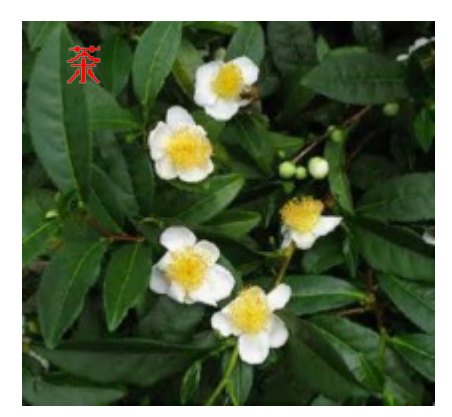
The tea plant c. sinensis.

not for its flowers, but for its leaves. Camellia Sinensis , or " Thea " is the tea plant, first brought to Britain in the early 1700s. Found in Asia from Assam in modern-day India to China, it is too tender to be grown outdoors in Scotland, even where the Gulfstream washes the shore, but will survive in gardens in the south of England.