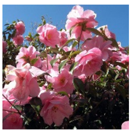
C. salunensis x c. japonica hybrid "Donation" Eng 1941 - Clarke.

the best camellia for planting across most of the British Isles. The myriad of cultivars originating from this cross are invaluable in many