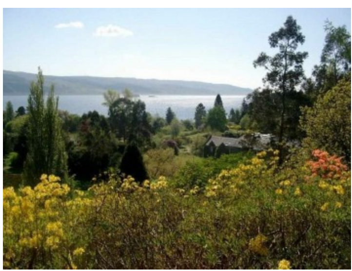
Crarae Gardens and Lodge on Loch Fine. Many camellias are included in the plantings at Crarae, but the rhododendrons are spectacular.

Lycium Barbarum is now used for health supplement purposes in the form of pills, juice, dried fruit, powders, seeds, and tea. It is known for its powerful antioxidant properties and potential benefits of related products including: Powerful antioxidant, Anti-fatigue properties, Improved sexual function, Improved metabolism, Immune system boost, Anti-aging properties, Blood pressure regulation and Cardiovascular health.