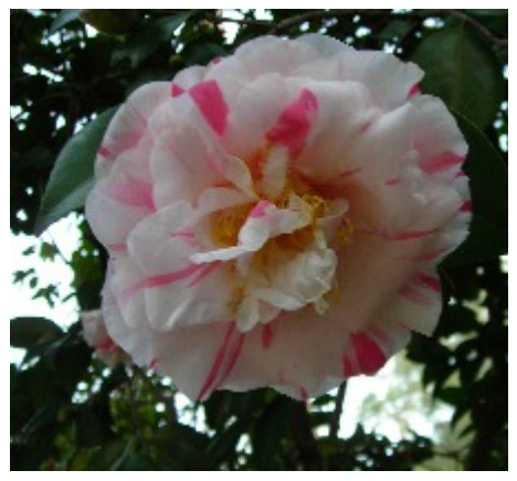
C. japonica "Big Beauty" McIlhenny 1941.