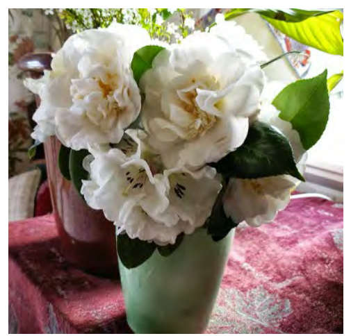
C. japonica 'Kate Sheppard' in a vase with 'September Snow' rhododendron.

Kate Sheppard. Parliament celebrated the centenary of women's suffrage by planting 'Kate Sheppard' camellia shrubs in Parliament's garden, and by placing a commemorative time capsule nearby. Various artworks commemorate the