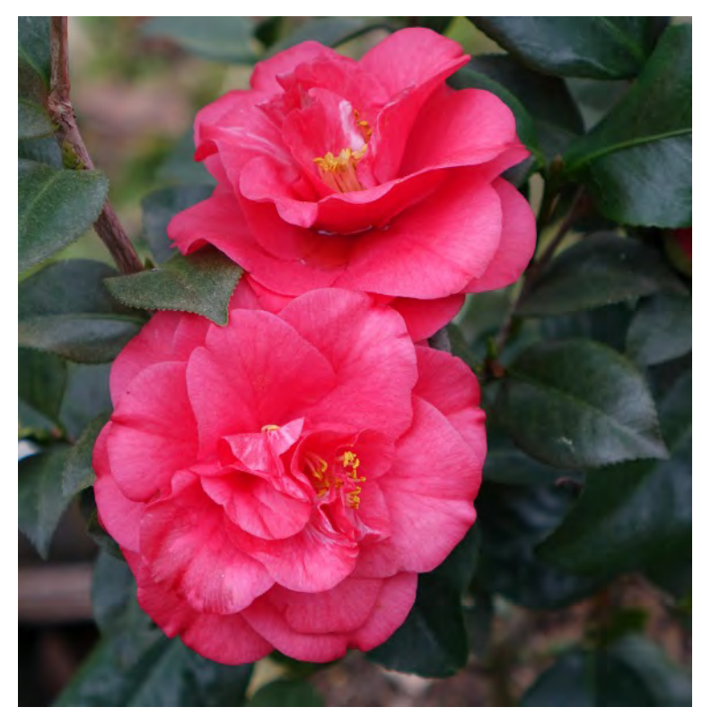
C. japonica 'Campbellii' Semi-double red. Guichard 1894 France.