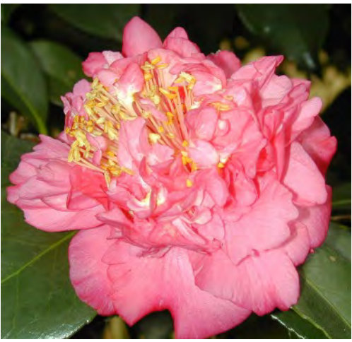
C. japonica 'Elegans (Chandler)' England, 1831