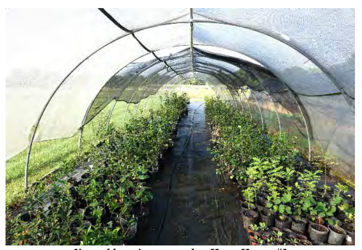
Year old cuttings moved to Hoop House #3