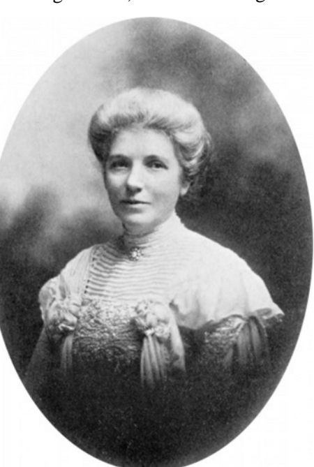
Kate Sheppard of Christchurch, the leader of the suffrage campaign.

The start of the campaign was quite modest. In 1887 two petitions signed by 350 women were presented to the House of Representatives. By the next year there were 800 signatures. But after this slow