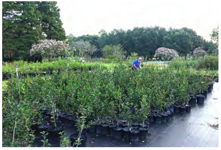
Tim Brown tends to understock in the can yard.

All the mist heads are automatically controlled by a leaf valve. Mist collects on the copper leaf and when it gets heavy it closes the valve. When the leaf dries off it opens the valve until the mist collects on it again.