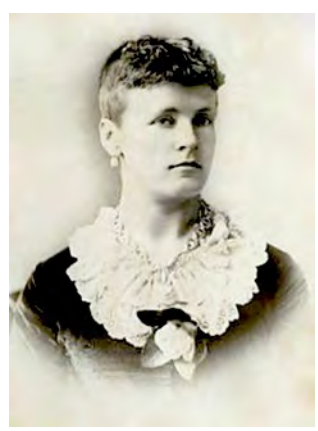
Portrait of an unknown suffragette, (Charles Hemus Studio Auckland, circa 1880.) The sitter wears a white camellia and has cut off her hair, both symbolic of support for advancing women's rights.

Suffrage opponents had warned that delicate 'lady voters' would be jostled and harassed in