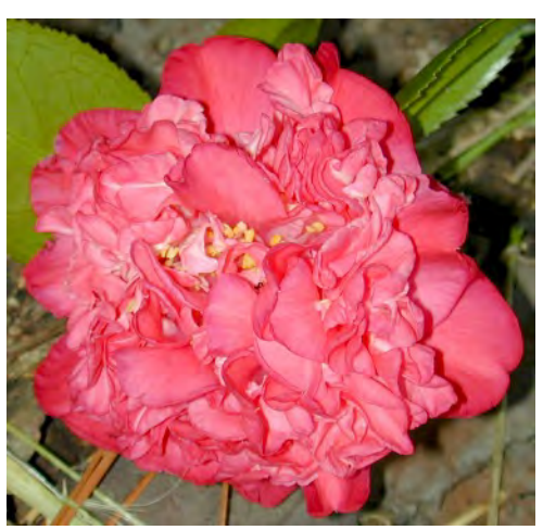
C. japonica 'Arajishi' Japan 1891. Early bloomer. Usually blooms in September, but occasionally has a bloom in August.

October usually brings blooms on the early blooming varieties and November features many more. Get some of the early blooming varieties such as Daikagura, High Hat or Arajishi to extend your blooming season.