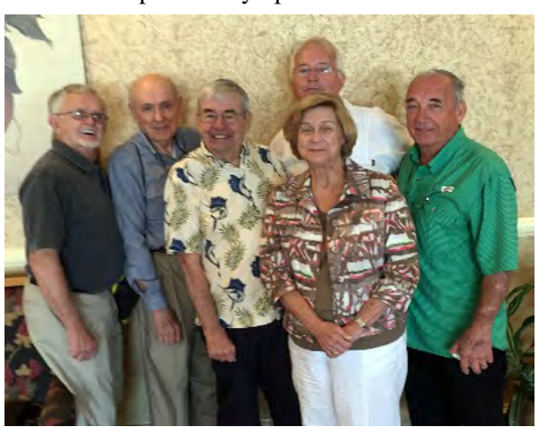
Gulf Coast Camellia Society officers and advisors met in Bay St. Louis, MS July 15 to plan the fall conference. The conference will be held at the Hollywood Casino in Bay St. Louis October 19-20, 2015.

Silent Auction: Items will be displayed in the Cypress Ballroom all day Tues. Bidding will end at 6:30 pm Tues. and must be paid for by 7pm. Prior to the