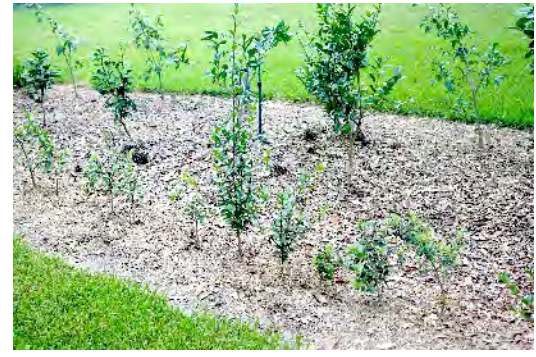
Row of Sasanqua seedlings lined out in 2014. Note 45" plant in center with 1/2" caliper. It is more than twice as tall as its largest neighbor. I will have to root some of these next year to find out if this a genetic trait.