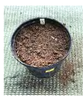
Scatter seed on surface and cover with peat moss.