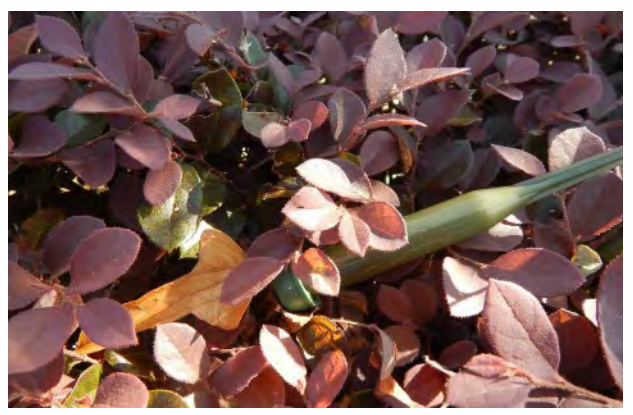
A few days later the foliage of the air potato vine begins to die.