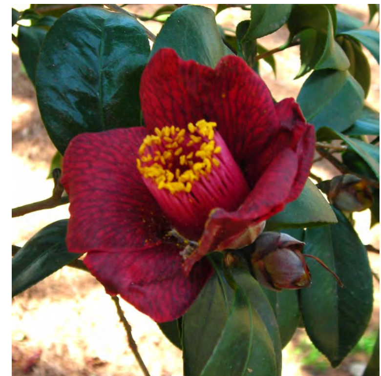
C. japonica 'Kon-Wabisuki,' Blackish, dark red, single, cup shaped flower. Listed in 1937 McIlhenny catalog.