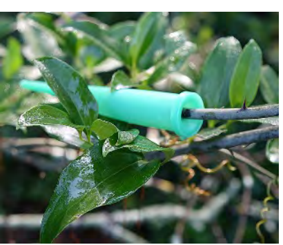
Select vine of proper size (1/8" to 5/16") to fit in hole of Aqua-pix.