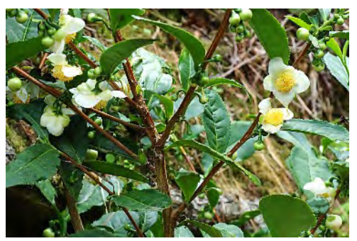
Camellia sinensis, "the tea plant of commerce"

ea, whether traditional or herbal, has long been rumored to bring health benefits to those who drink it. Traditional teas — black, green and white teas made from the leaves of the tea shrub, Camellia sinensis — have been found to contain antioxidant compounds known as flavonoids, which can help protect tea