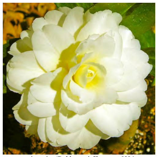
c. japonica 'Dahlonega' Homeyer, 1986