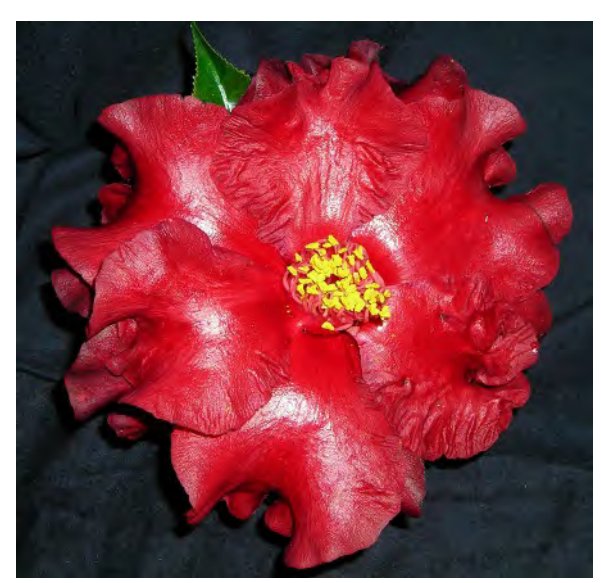
Red camellias stand for passion and excellence. C. japonica 'Black Magic' 1992 Nuccios, California

C. japonica 'Alba Plena' China to England 1792