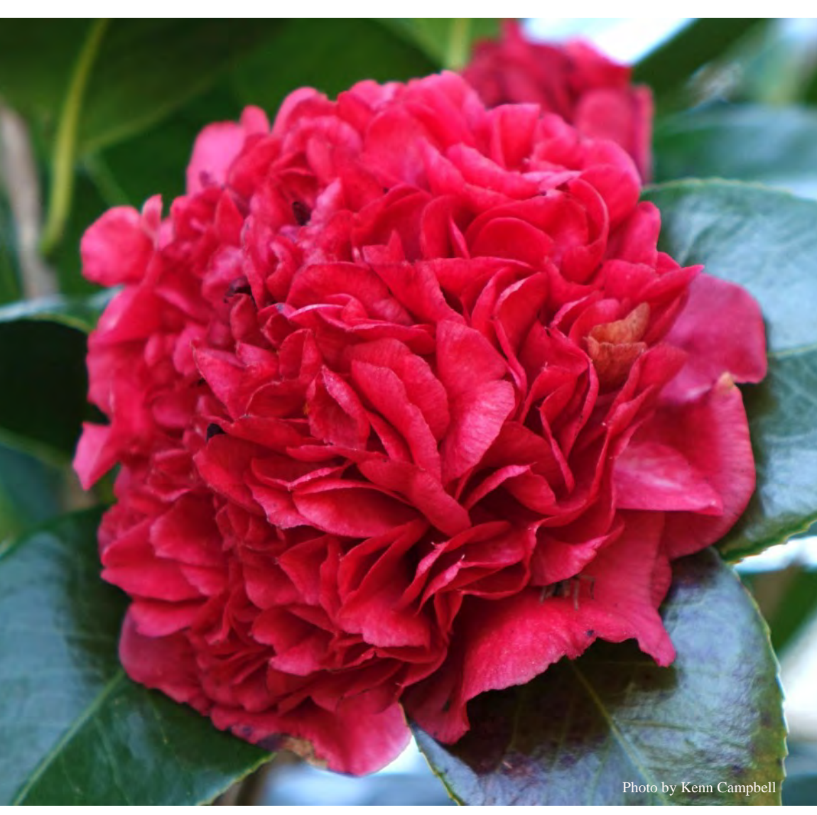
Camellia japonica 'Mariana (Red Waratah)' 1866

A Publication of the Gulf Coast Camellia Society