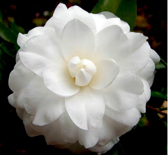
White camellias signify admiration, luck, perfection and loveliness.

Unlike most flowers, the calyx falls right along with the petals after blooming, and this is said to represent an everlasting union between lovers in Chinese folklore. Camellias have long been used as a token for showing devotion by young lovers, as the petals reflect the lady and the calyx represents the man who has been entrusted to protect her. In this poetic analogy, the man does hold her and protect her from