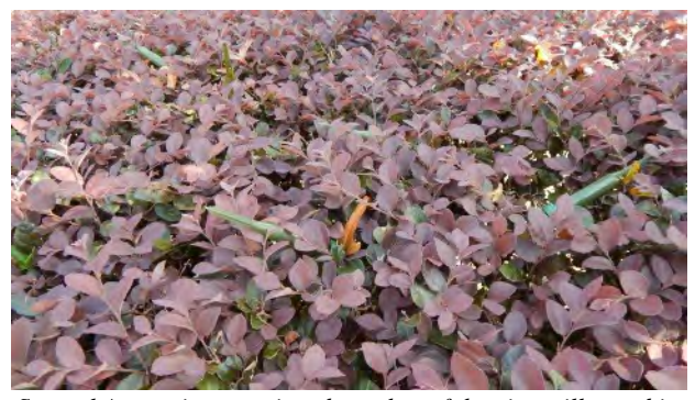
Several Aqua-pix on various branches of the vine will speed its destruction.

I have used the following method to good effect previously. Recently I noted luxuriant growth of air potato vine among my neighbor's Loropetalum shrubs. Because Loropetalum (a.k.a. Chinese fringe tree) has purplish foliage, it occurred that this would make for a photo demonstration because of the different coloration of leaves between the vine and the Loropetalum.