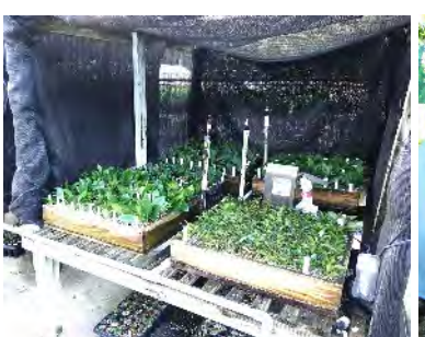
Mist heads controlled by leaf valve.