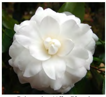
C. japonica 'Alba Plena'

right to vote. It is also featured on the N e w Zealand ten dollar n o t e alongs ide Kate