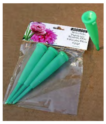
Aqua-pix or equivalent may be purchased at florist or hobby shops. Or perhaps you already have some left over from cut flowers which were given to you.

One may dig up the roots and eradicate the plant that way. However, the problem becomes complicated when the vine has roots intertwined with a favorite shrub. The air potato is sensitive to chemicals found in commercial products such as Garlon 3A, Killzall or Roundup.