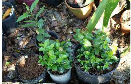
Set in shady spot until ready to plant.