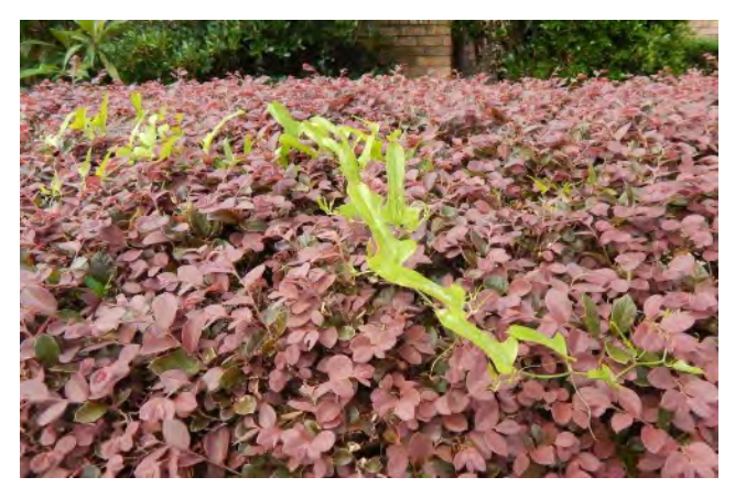
Air potato vine growing in Loropetalum shrub.