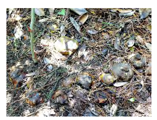
Potato-like growth at root ready to sprout new vines.