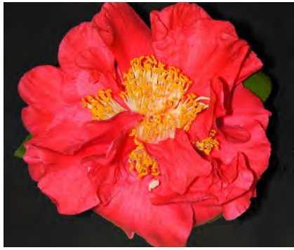
C. japonica "Blood of China" 1905, by Stoutz Garden, Mobile, AL