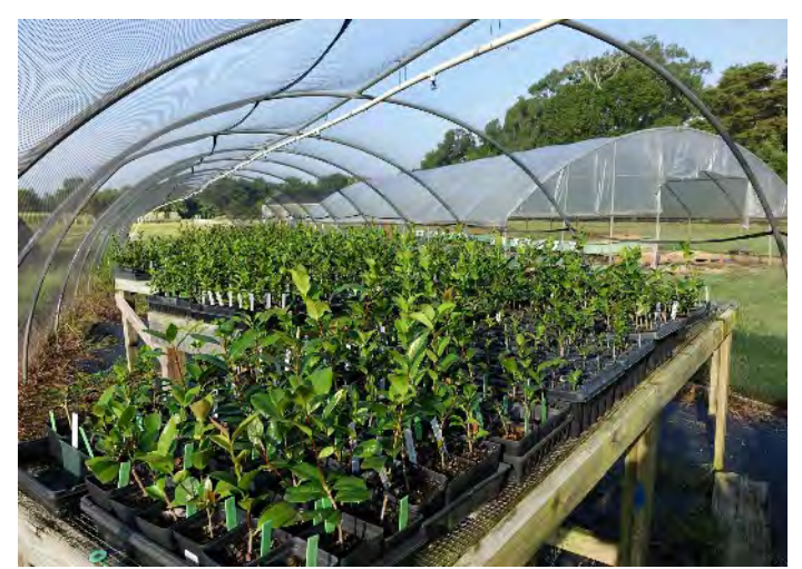
Potted cuttings moved to Hoop House #1