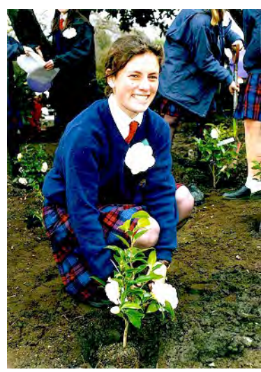
A schoolgirl plants a 'Kate Sheppard' camellia in a public garden in Hastings on White Camellia Day.

Why white camellias were chosen to represent women's right to vote is not known. Most likely it was because the camellias would have been one of the few flowers in plentiful supply in September. Whatever the reason, the white camellia became, and remains, the symbol of women's suffrage in New Zealand.