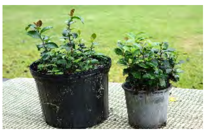
Seed planted in October 2014 are ready for planting this fall.