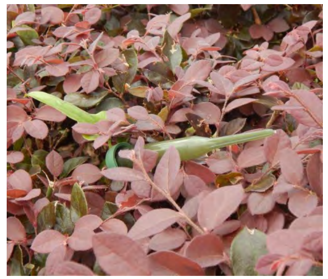
Aqua-pix with Roundup inserted on air-potato vine.