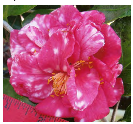
Henry VIII, introduced by Gerbing Camellia Nursery, Fernandina, FL. I registered it last year.

The purpose of conservation. It is necessary to continue the order so that future generations will appreciate and become aware of the heritage in order to build toward the future. Once DNA is lost from a link in camellia heritage it is gone forever. Our purpose is to protect the past for the future.